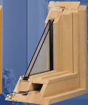
Paint Grade Pine