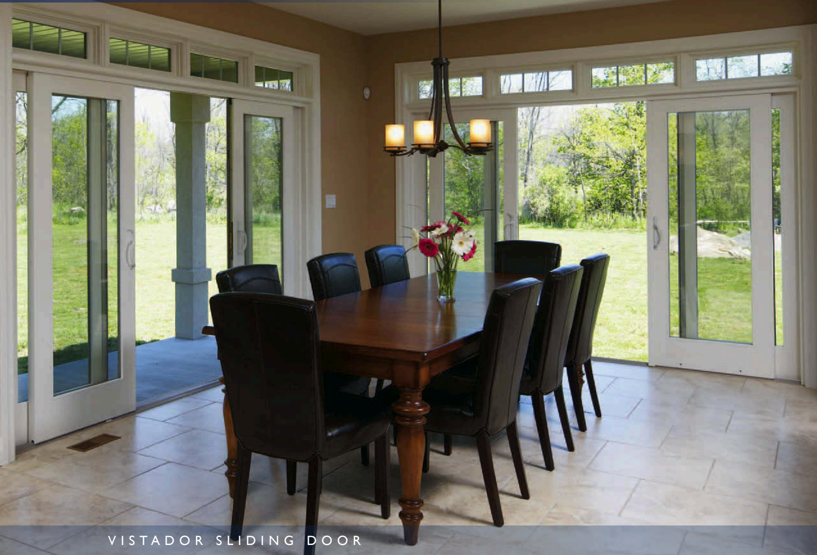
VISTADOR SLIDING DOOR